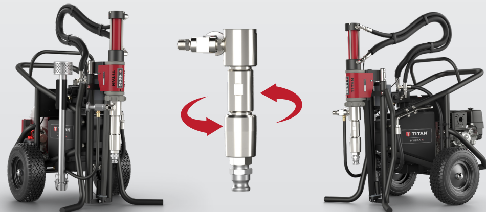
HYDRA X 4540

HYDRA X 7230 TO 4540 CONVERSION KIT 2432905A