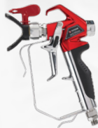
RX-Pro 2-Finger Gun with 517 Tip