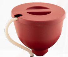
Elite 2000 Hopper