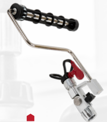
SprayRoller with 517 Tip