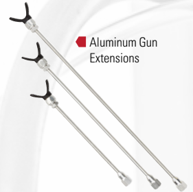
Aluminum Gun Extensions